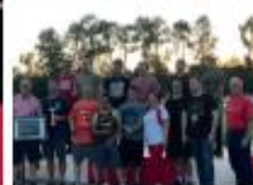
June 15, 2020, National Guard Finale Night at HKC