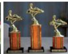
Montgomery County Food Bank/Houston Karting Complex COVID 19 National Guard Challenge Winner's Trophies