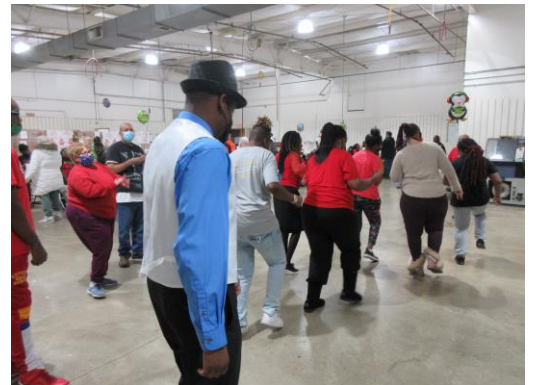
Folks Celebrate Holidays by dancing!!