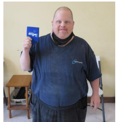
North employees Caught Being Safe for November